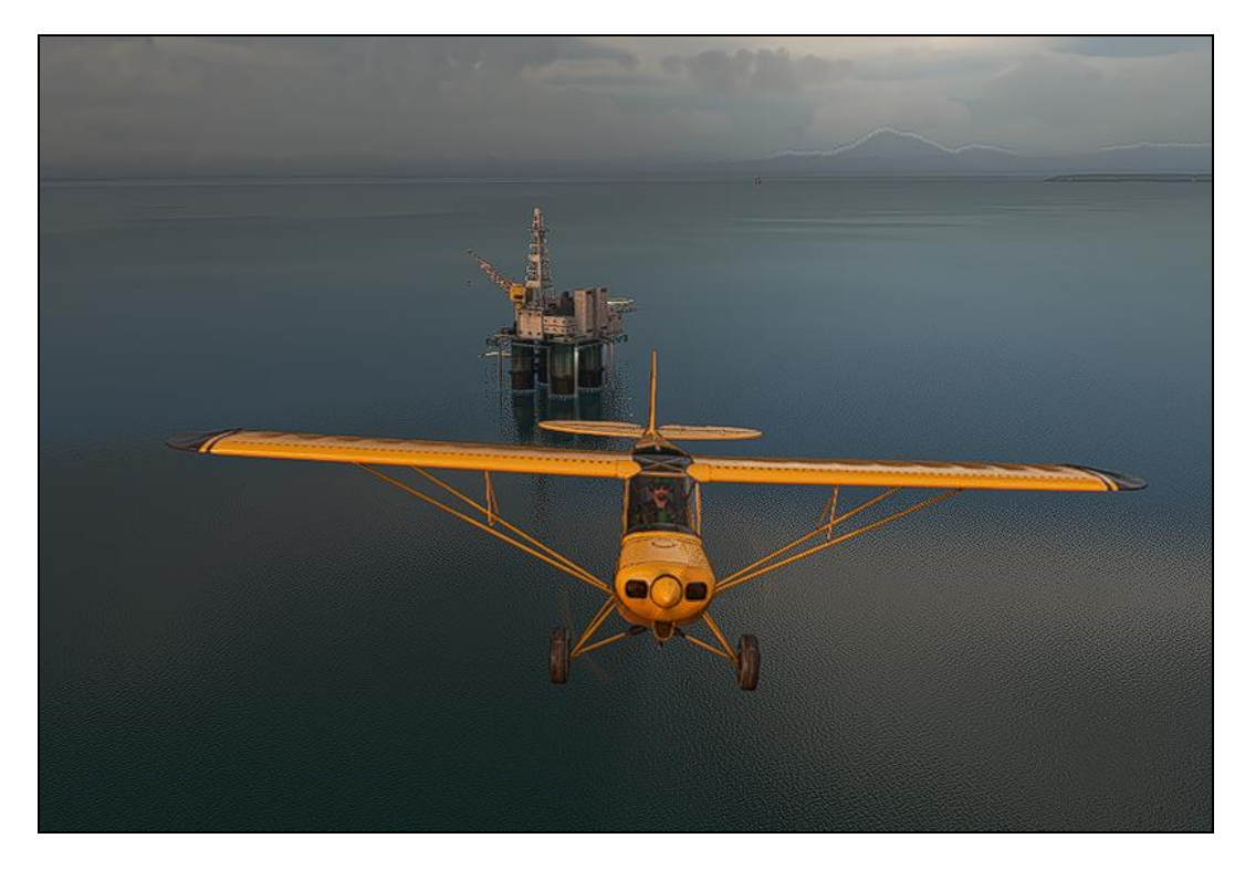
Hope all enjoy this MSFS expedition exploring some of the sites in Alaska.

NOTE: For those of you who don't like "missions" per say, I have included the flight plan (both LNM and MSFS version) on which this bush trip is based as well as have included a sky vector map link for those who might want to remove any automated nav aids and navigate via static map, dead reckoning and marking land marks to ascertain position. (But make sure you grab your watch or E6B just in case: don't want to get lost!)