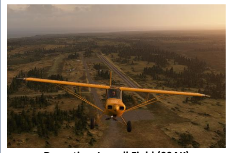
Departing Lowell Field (00AK)